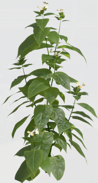
Marvel of Peru