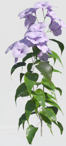
Pink Morning Glory