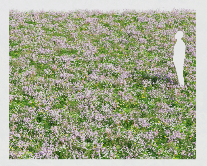
Forest Pack Preset 2